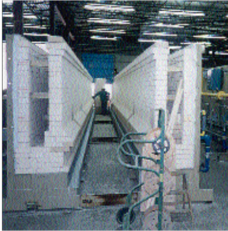
Prefabricated side wall sections of a sanitaryware tunnel kiln before shipping to the job site. BNZ 26-60 IFB is used on the hot face and BNZ 2300 HS IFB is used as back-up insulation.

Some of these have a high free-silica content. This is thought to be more reactive with alkali vapors. The higher thermal conductivity is also a drawback.